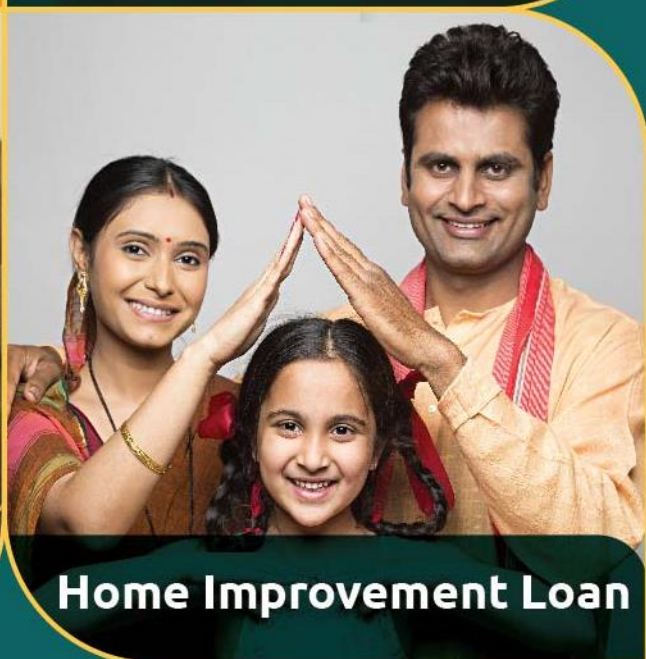
Home Improvement Loan

UNSECURED LOANS UP TO ₹3 LAKHS WITH TOP-UP LOAN FACILITY